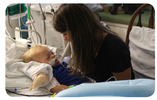
There's no big splash like in the movies.